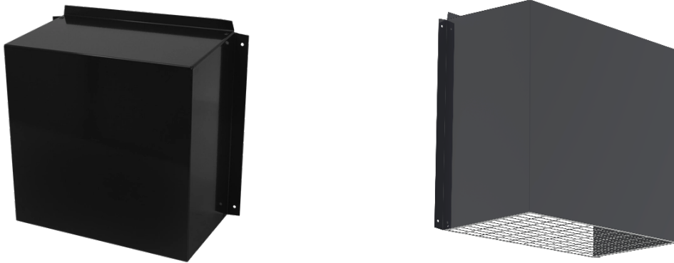
Figure 1: Storm Cap seen from above (left) and from below (right)

Cap for fresh air intake and exhaust air. The cap is designed for facades with a fixed shield and grille.